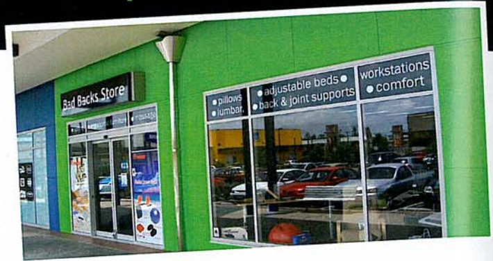
superstore in Underwood; the first of its kind in Brisbane.

"Following the resounding success and interest in our retail stores in Melbourne and Sydney, we are most excited about establishing a