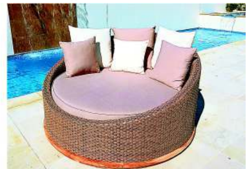
VICKI ROUND LOUNGER, $2099 FROM THE SAVVY GARDEN.