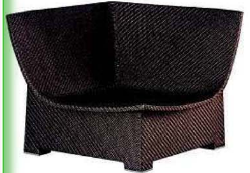
DEDON SPA CORNER MODULAR, $2495, DOMO COLLECTIONS.