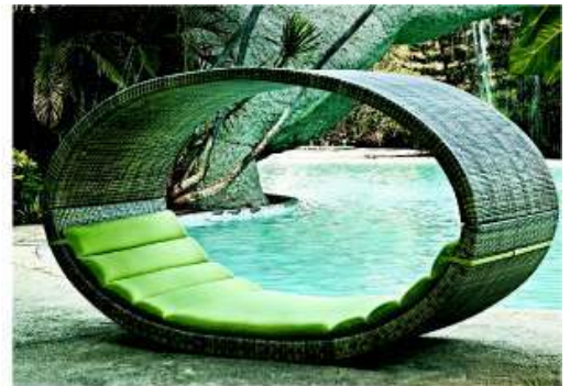
OCEANIA SUN BED, $2599 FROM THE SAVVY GARDEN.