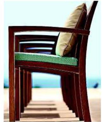
ROYAL BOTANIA EXIT STACKABLE ARMCHAIRS, $930 (CUSHIONS EXTRA) FROM PARTERRE GARDEN.