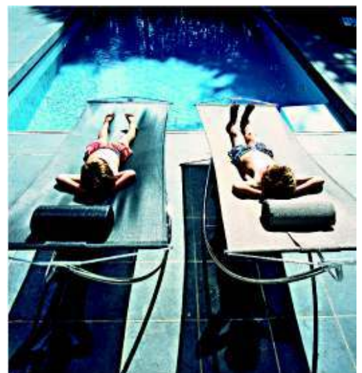
E-Z HAMMOCKS, $1650 EACH FROM PARTERRE GARDEN.