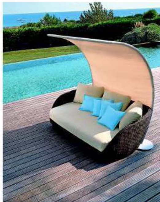
GREENFIELD SAN TROPEZ SOFA, $9385 FROM FANULI FURNITURE.