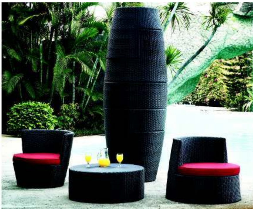
APOLLO SPACE SAVER SUITE, $2699 FROM THE SAVVY GARDEN.